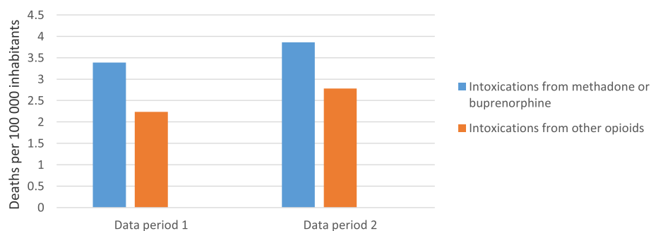
Fig. 2 Opioid-related deaths in Skåne grouped by the substances that caused the intoxication, by period

The proportion of individuals who at the time of death were registered as resident in municipalities with unchanged access to OST increased between the data collection periods. The expansion in the number of patients receiving OST may have helped to restrain opioid-related mortality in municipalities with improved access to OST, where opioid-dependent individuals are able to initiate OST more easily and may now also remain in treatment regardless of relapses. A previous evaluation has shown proximity to the clinic to be important for patients in OST when choosing a treatment facility [19]. In recent years, there has been a shift in several western countries towards an increasing number of opioid deaths