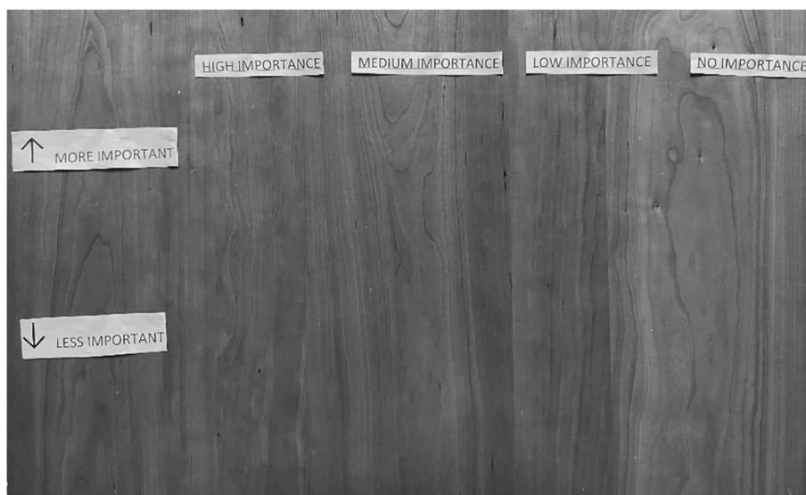
Fig. 1 Visual of Pile-Sorting Task Activity. Note: Participants were able to place items under each bucket and then to rank order those items within each category of importance

prescribed” and “stop taking my suboxone someday” in the same pile, the overall inter-item matrix would have a 28 in the second row-first column. The process of creating the matrices was automated using the R Statistical Programming Environment [41].